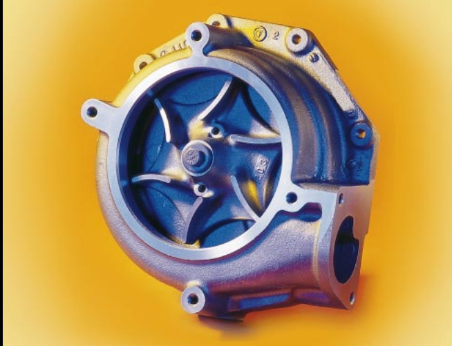
Cat Gasket and Seal Kits feature a modular design for specific engine model and serial number arrangements.